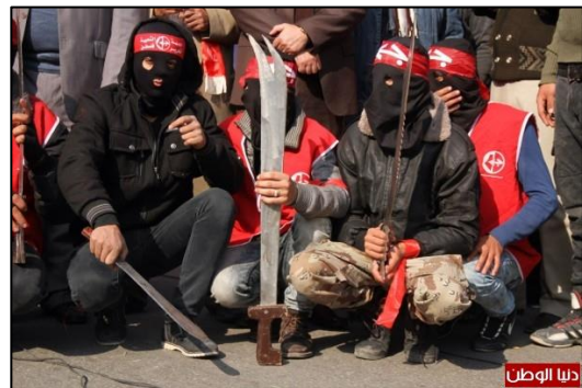
PFLP members at the 2015 PFLP rally

2. In 2015, Bisan spoke at a rally in Gaza celebrating the 48 th anniversary of the founding of the PFLP . She wore full PFLP military garb. The rally overtly supported terrorism and included teenagers and children carrying swords and knives. In an interview with media , she dressed in PFLP military clothes.