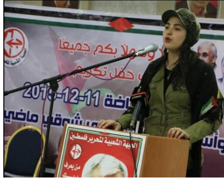
Emmy nominee Bisan Atef Owda speaking at an event of the US-designated terror group PFLP in 2015.